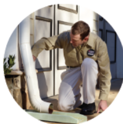
Inspects the property for signs of termites

Sentricon® is a patented and proven termite elimination system that provides a continuous perimeter defense to kill termites and their colonies well before they make your home their home. Sentricon is the only system that continues to guard structures by monitoring for future invasions.