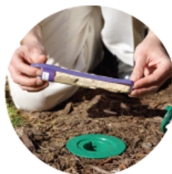
Continues monitoring Sentricon stations as needed to protect against future invasion