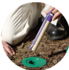
Once termites enter the station, the Recruit HD termite bait is immediately available