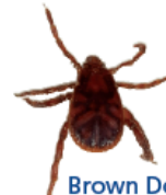
Brown Dog Tick