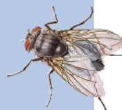
Blue Bottle Fly