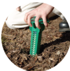
Places Sentricon® stations containing Recruit® HD termite bait in the soil around the home