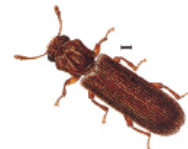
Powder Post Beetle