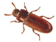
Confused Flour Beetle