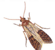
Indian Meal Moth